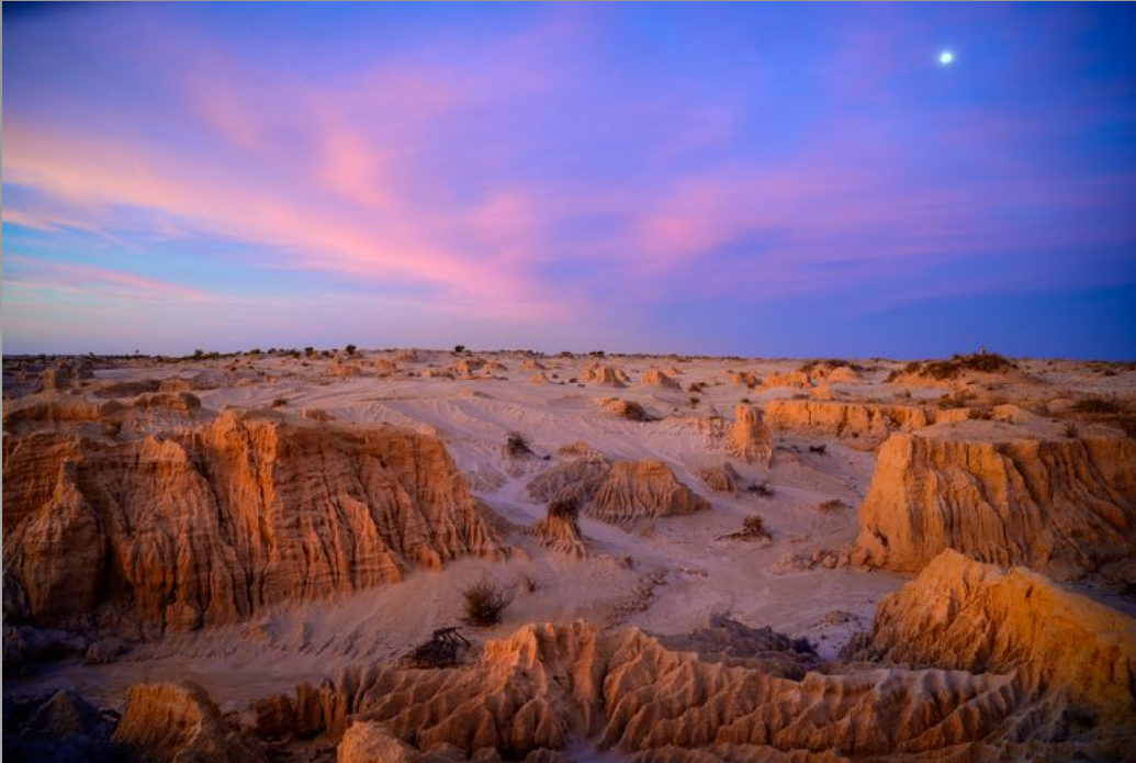
'Mungo Under the Moon: Russell Monson